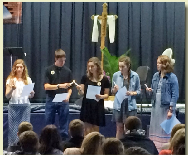
2016-17 Diocesan Youth Council members