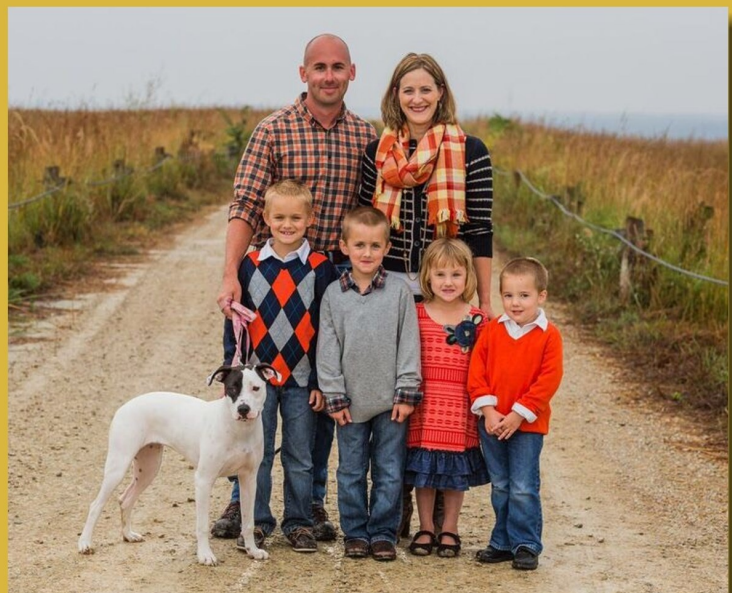
The Redetzke Family