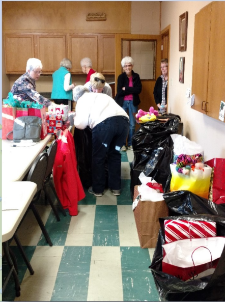
Ladies of Seven Dolors prepare Giving Tree gifts for pick up.