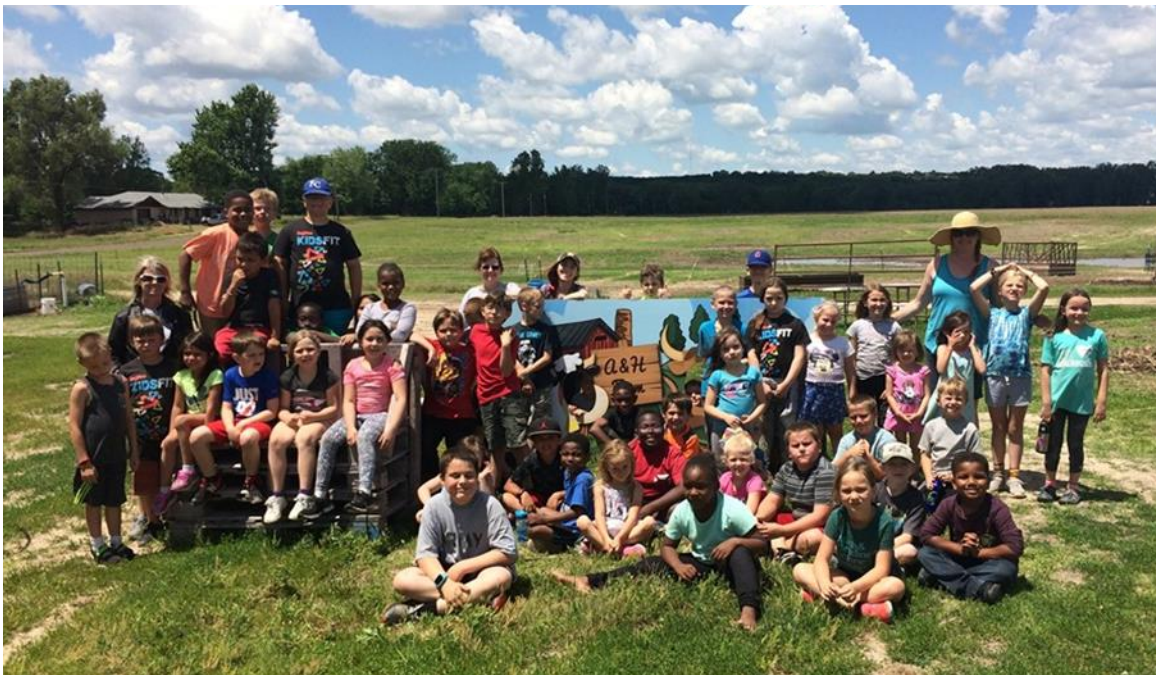
Our Summer at St. Patrick's in Ogden