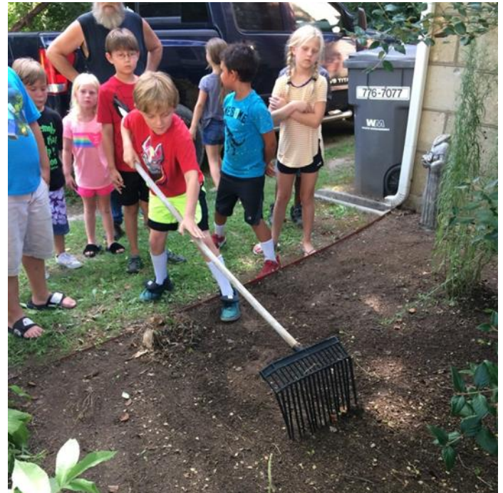
Pictures of youth in action courtesy of Torri Jones, Ogden Elementary School.