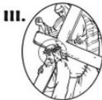
JESUS FALLS THE FIRST TIME