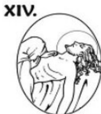
JESUS IS PLACED IN THE TOMB