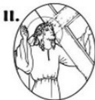
JESUS ACCEPTS HIS CROSS