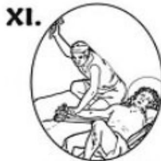
JESUS IS NAILED TO THE CROSS