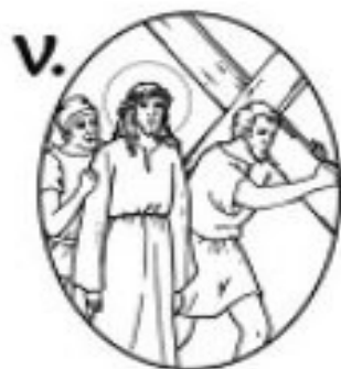
SIMON HELPS JESUS CARRY THE CROSS