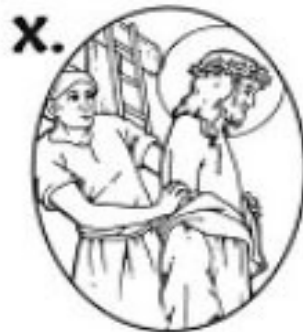
JESUS IS STRIPPED OF HIS GARMENTS