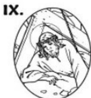
JESUS FALLS THE THIRD TIME