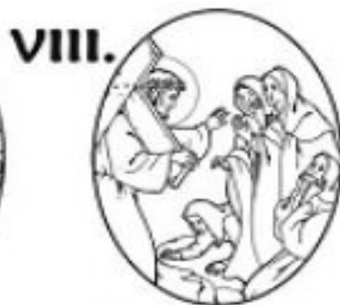
JESUS MEETS THE WOMEN OF JERUSALEM