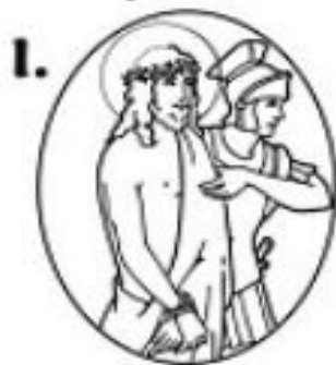
JESUS IS CONDEMNED TO DEATH