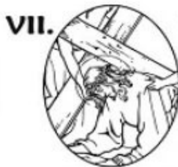
JESUS FALLS THE SECOND TIME