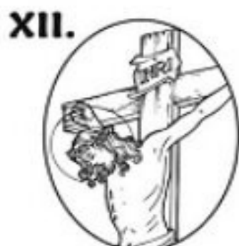
JESUS DIES UPON THE CROSS