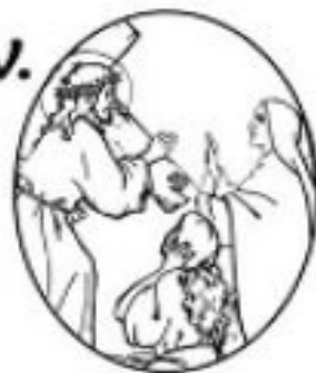
JESUS MEETS HIS MOTHER MARY