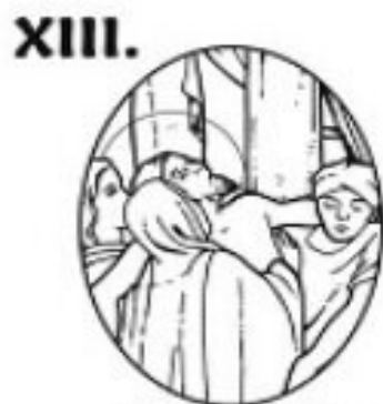
JESUS IS TAKEN DOWN FROM THE CROSS